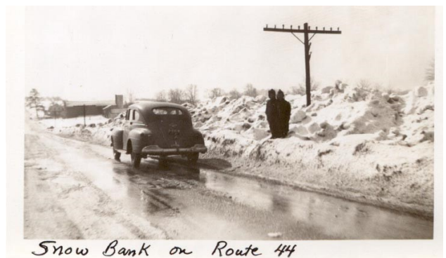
Snow Bank on Route 44

Enjoy this undated photo from the MTHS archives.